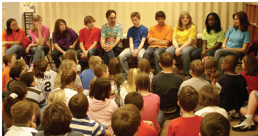
A classroom visit at an elementary school

Vitamin L works continuously to integrate the messages of our songs with teaching materials and character education curricula. Furthermore, our youth singers are truly dedicated to our organization’s purpose, taking to heart the roles they play not just as stage performers but also as peer leaders and mentors.